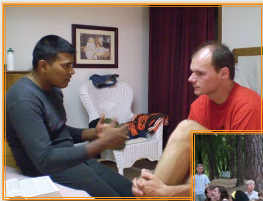
Sri Lankan and Czech Republic I-RMH participants